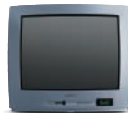
PHILIPS 21" CRT