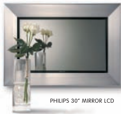
PHILIPS 30" MIRROR LCD