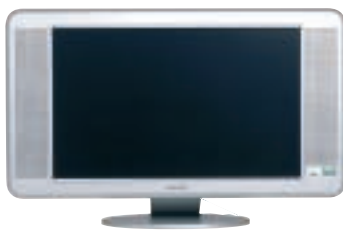
PHILIPS 23" LCD