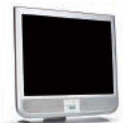
PHILIPS 20" LCD