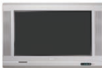
PHILIPS 28" CRT