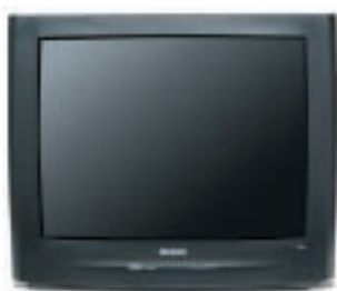
PHILIPS 28" CRT