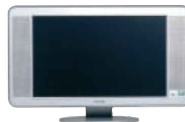
PHILIPS 26" LCD