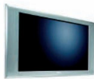
PHILIPS 30" LCD