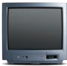
PHILIPS 17" CRT