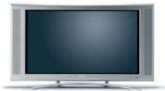
PHILIPS 42" Plasma