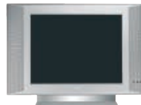
PHILIPS 15" LCD