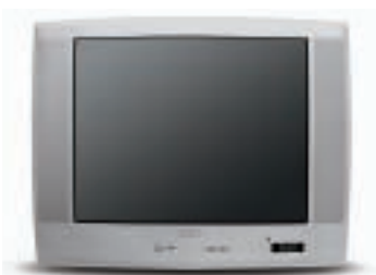
PHILIPS 25" CRT